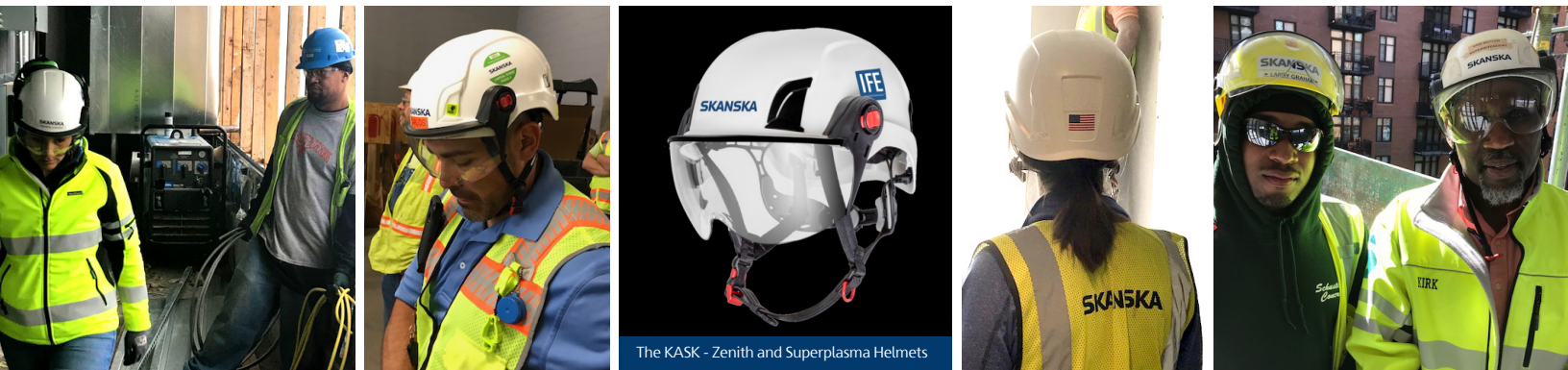
The KASK - Zenith and Superplasma Helmets